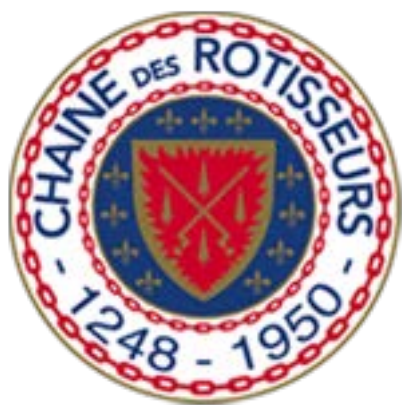
Finally a member