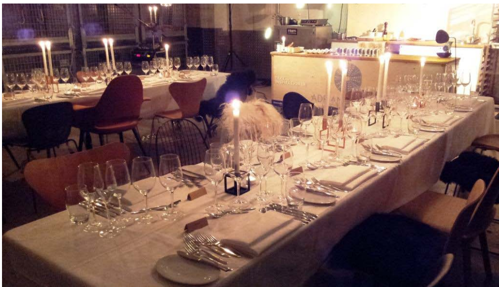
'Les 7 doigts de la main' at the Festspillene in Bergen