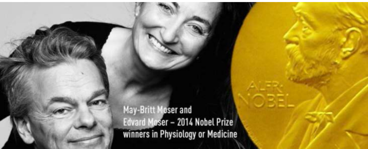
May-Britt Moser and Edvard Moser – 2014 Nobel Prize winners in Physiology or Medicine