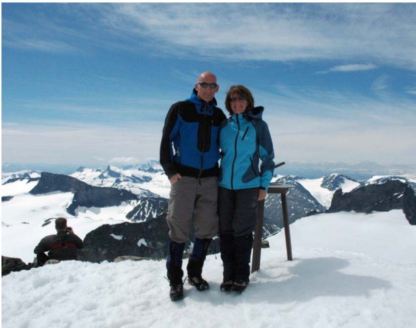
On top of Norways highest mountain