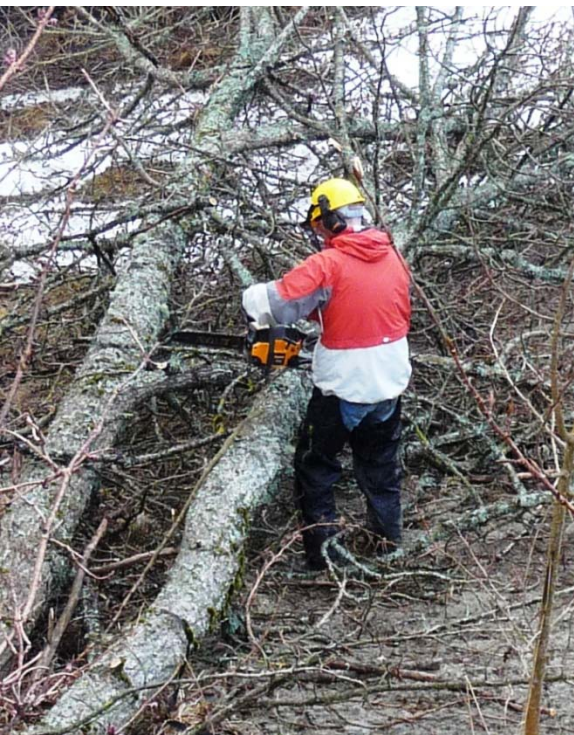
Albert felling trees with his chain saw

Despite its high standard of living, it's often back to nature and back to basics in Norway. Which suites us perfectly ☺