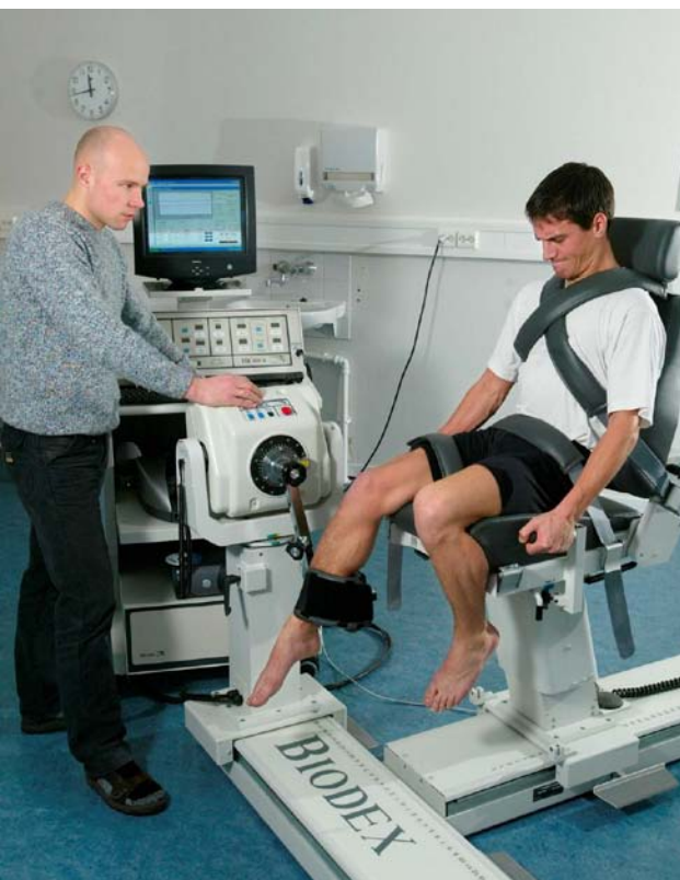
Testing the subject's strength at HMS