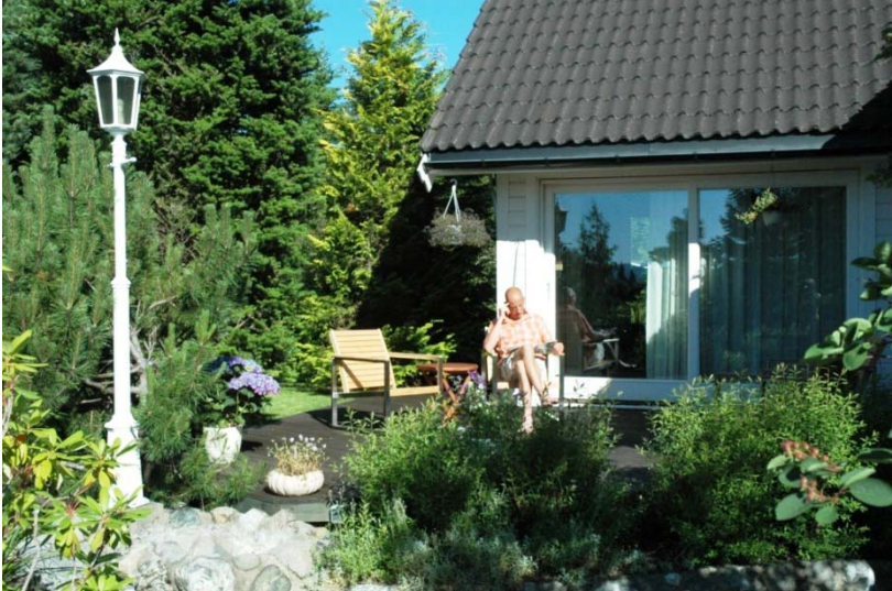
Albert relaxing on our terrace

2010 was the first full year in our new house. Located at the outskirts of Trondheim, at the edge of the forest , it is just perfect for us here. We like being outside, and we love the regular visits of the local wildlife.