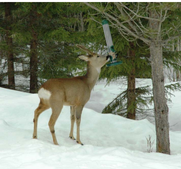
Eh, that's our bird feeder...