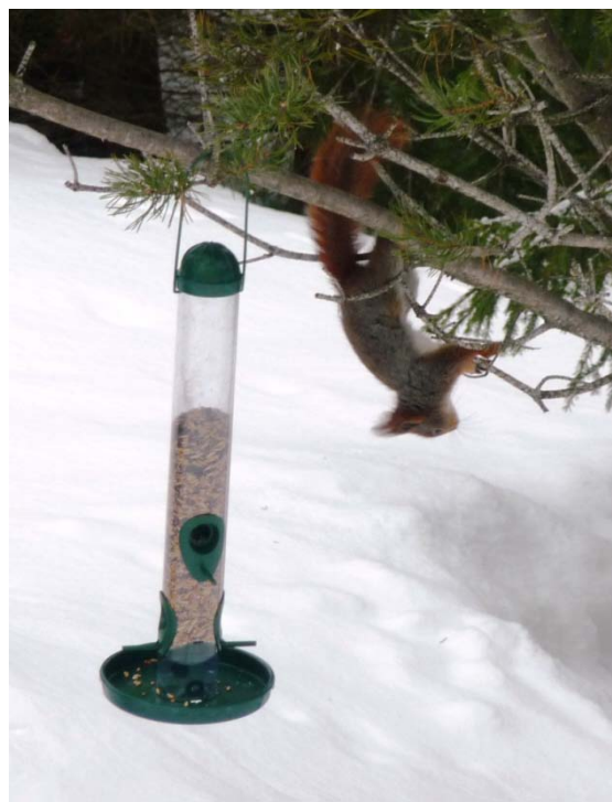
That's still our bird feeder...