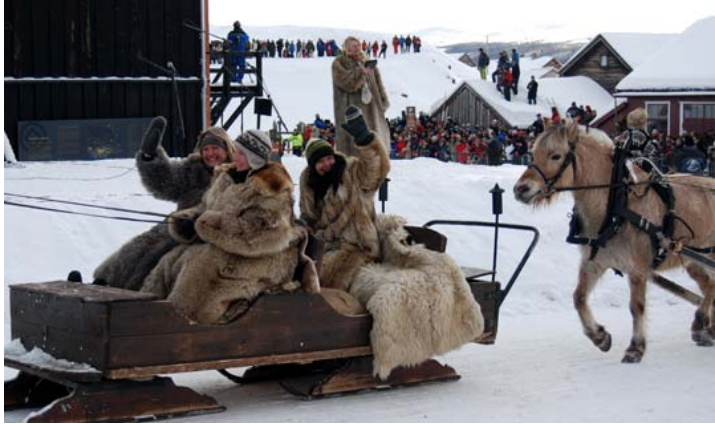
Martnan in Rørø