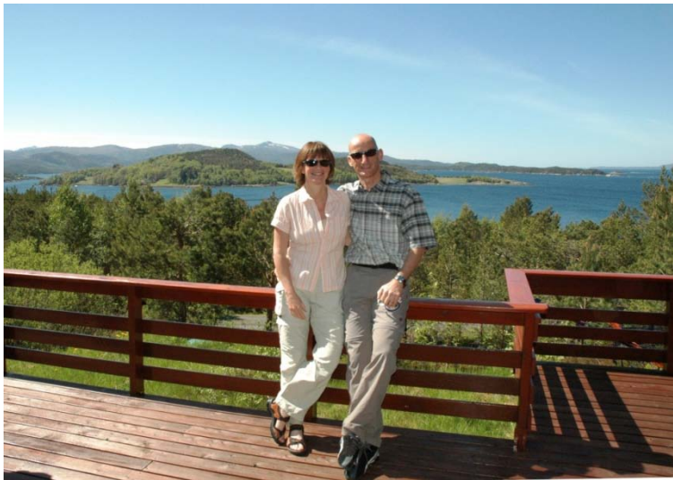
Partying at Magerøya in Hemne