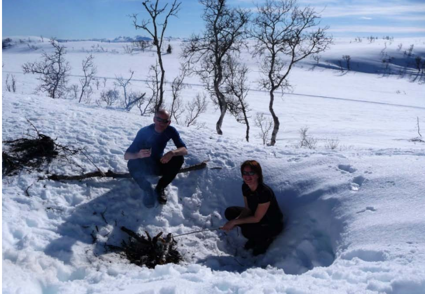
Grilling sausages in the mountains at Easter