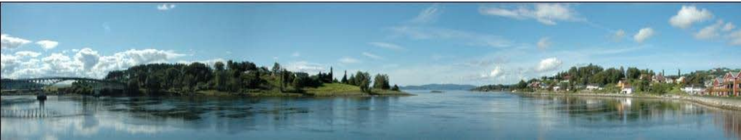
We spent our 3rd anniversary at Inderøy