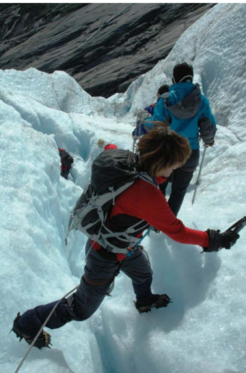
Jumping around on blue ice