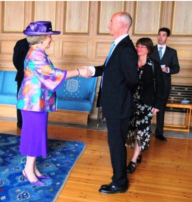
Meeting queen Beatrix in Oslo ☺

Norway has much to offer in terms of nature and culture, and we enjoy very much being part of that.