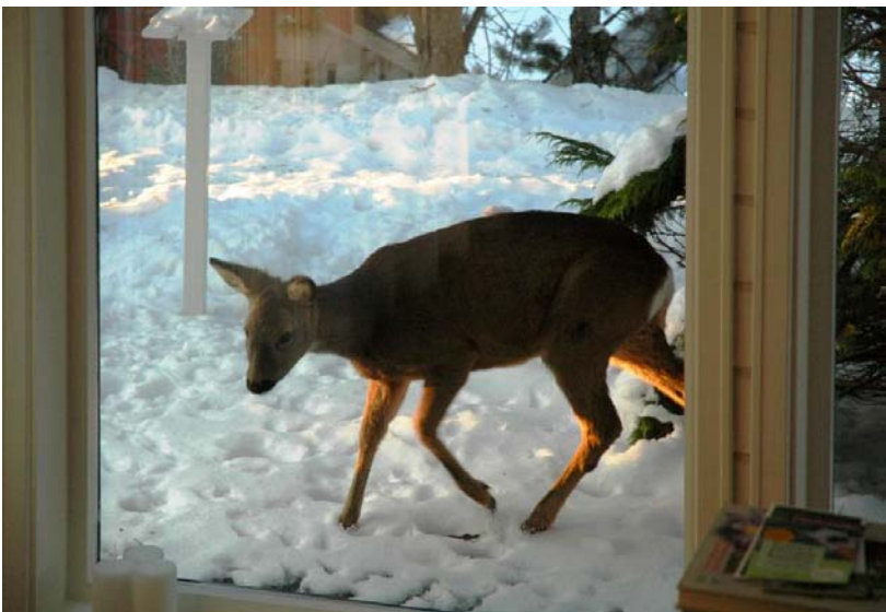
Sometimes you wonder whether they want to get inside