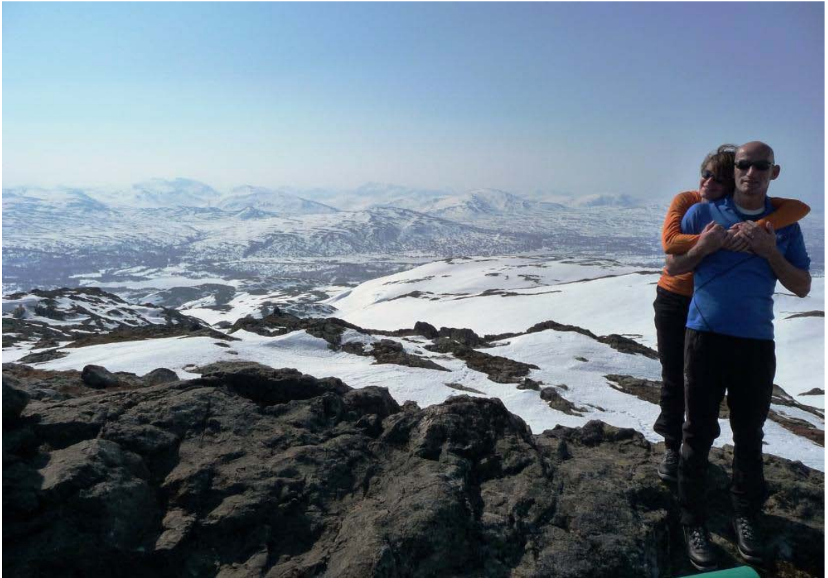
Easter on top of Resfjellet, 1106 m