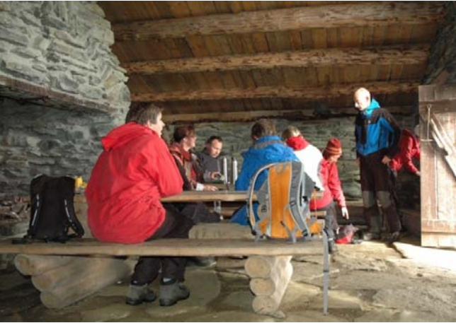
Discussing future plans

In September, the HR Department went for two days to the mountain cabin of one of their colleagues to discuss future directions.