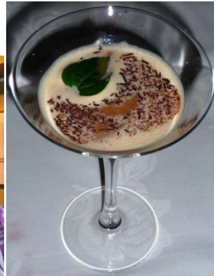
Bar rom Rose