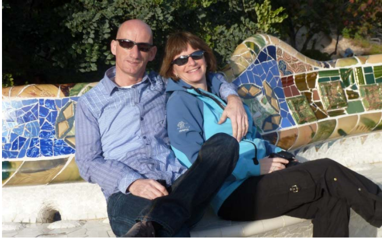
Enjoying a beautiful day in Gaudi's city, Barcelona