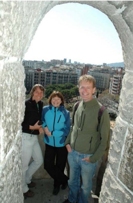
Visiting Sagrada Família, Gaudi's amazing cathedral