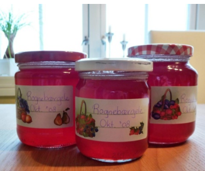
Make your own jam