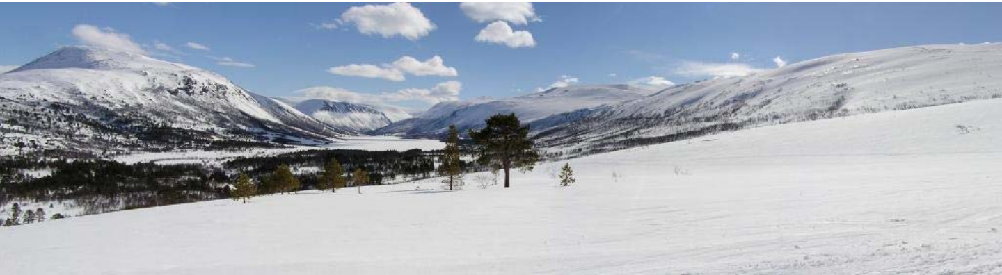
Storlidalen, in Trollheimen