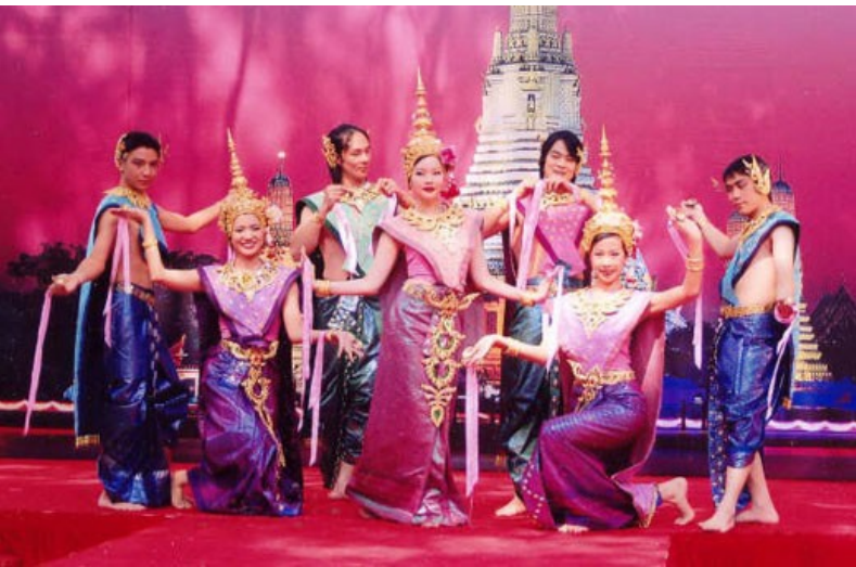
SBUN-NGA, cultural performance from Thailand

The past year was also filled with many cultural events: