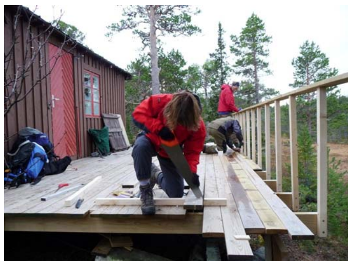
Help friends build a new veranda