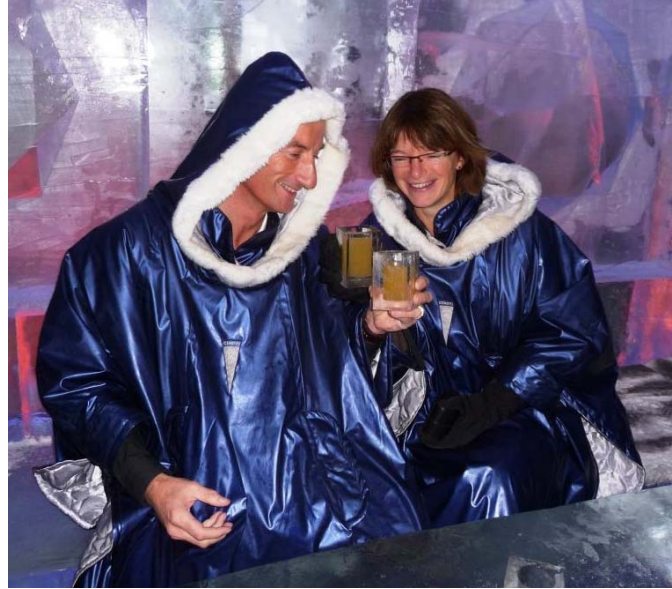
Celebrating turning 45 in Stockholm's Ice Bar