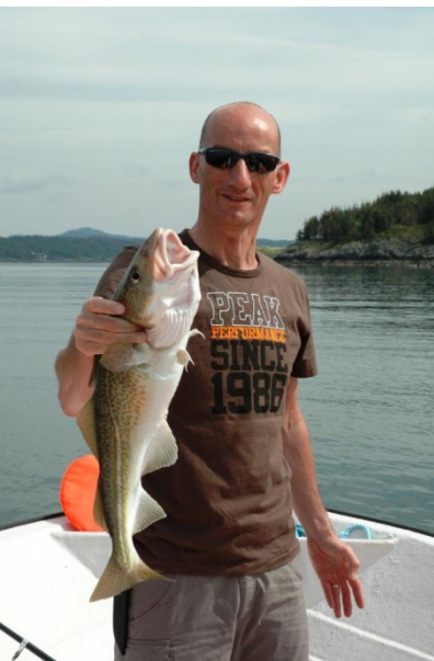
Catch your own fish

Norway has a rich culture full of traditions that we enjoy being part of. Here's some examples!