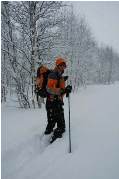
Where's the ski tracks?

This year brought us 4 months of deep snow. Terrific! We spent lots of time skiing or walking on snow shoes, both close to home and in Trollheimen, a national park just south of Trondheim. Sometimes just the two of us, but mostly with Dutch visitors or Norwegian friends. Very nice and lots of fun ☺