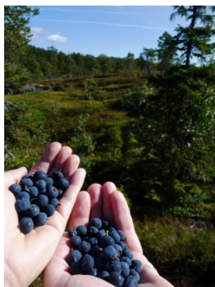
Pick your own berries