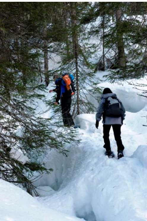
Snow walking east of Trondheim

This year brought us 4 months of deep snow. Terrific! We spent lots of time skiing or walking on snow shoes, both close to home and in Trollheimen, a national park just south of Trondheim. Sometimes just the two of us, but mostly with Dutch visitors or Norwegian friends. Very nice and lots of fun ☺