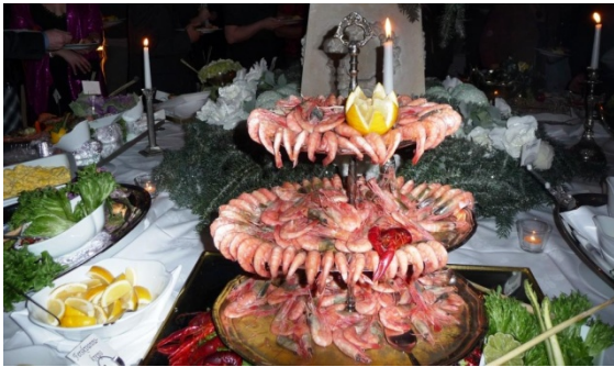
*Julebord", the big Christmas dinner