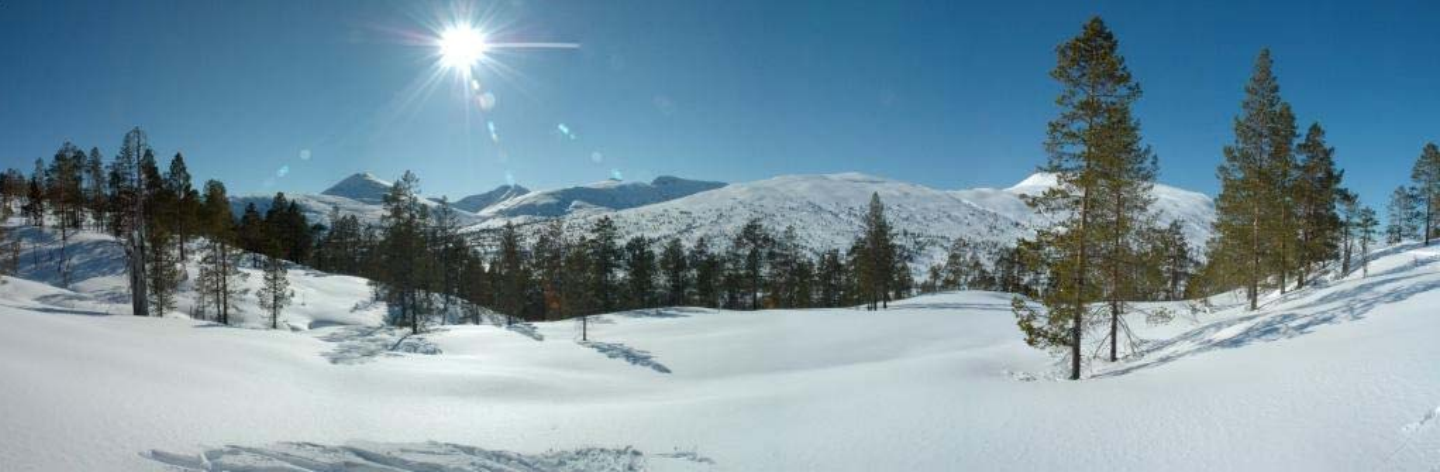
Vindøldalen, in Trollheimen