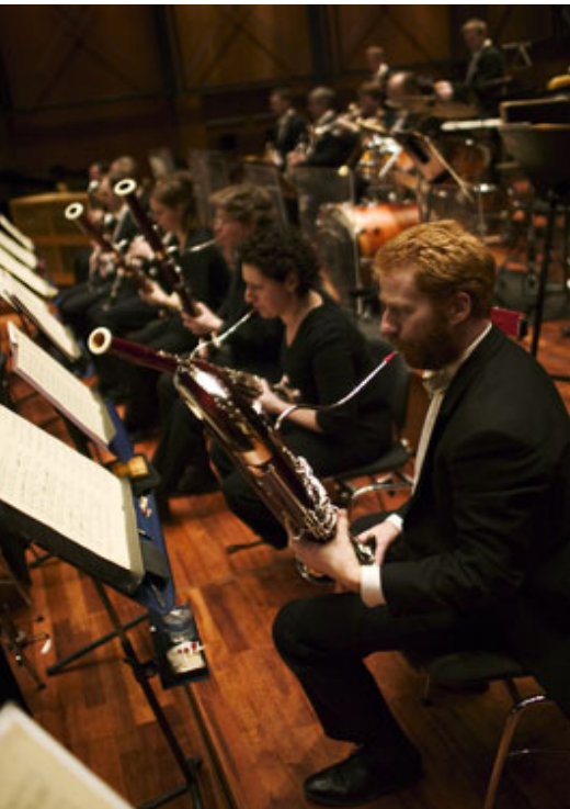
Our monthly concerts of Trondheim Symphony Orchestra