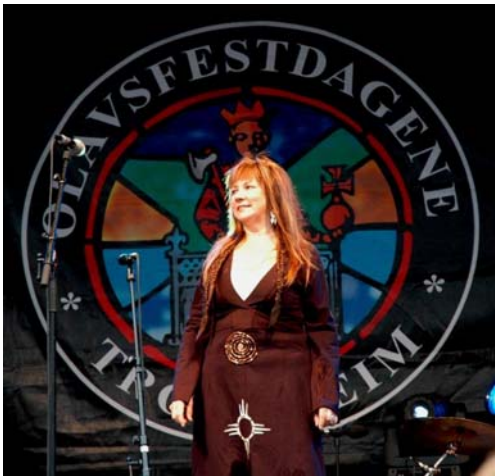
The Samic singer Mari Boine