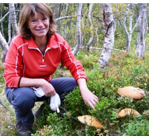
Find your own edible mushrooms