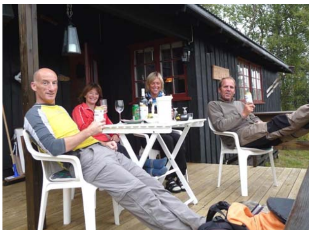
Do as the Norwegians: "gå på hyttetur" ...