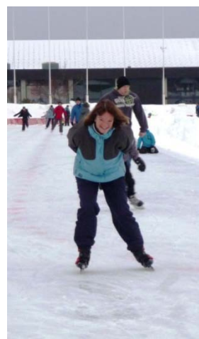
... or "på skøyte"