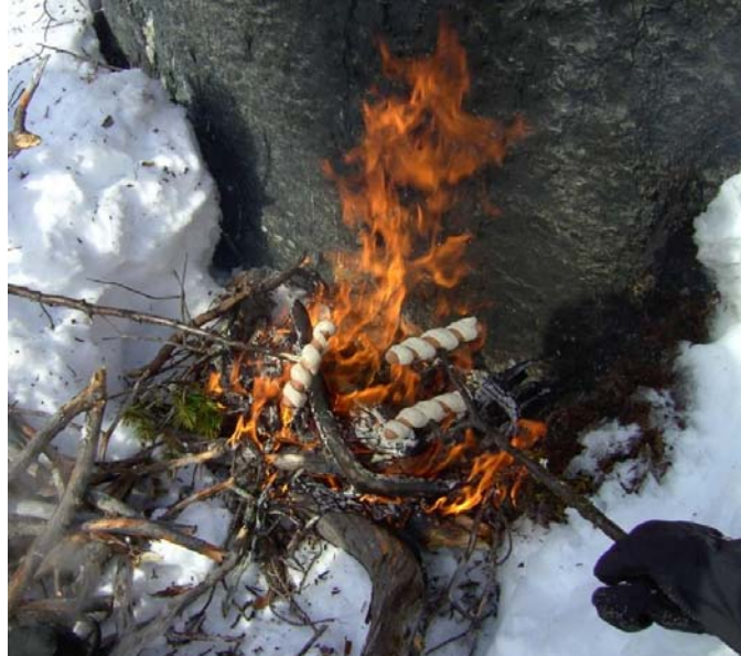
Make your own hot dog: bread dough wrapped around a sausage