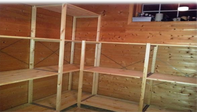
A new racking system in the storage room