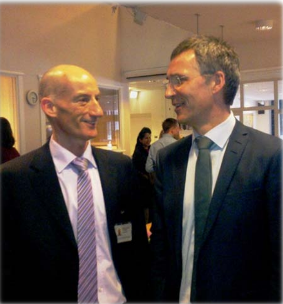
February: Jens Stoltenberg, the Norwegian prime-minister, visited the Faculty of Medicine to officially open the Norwegian Brain Centre.