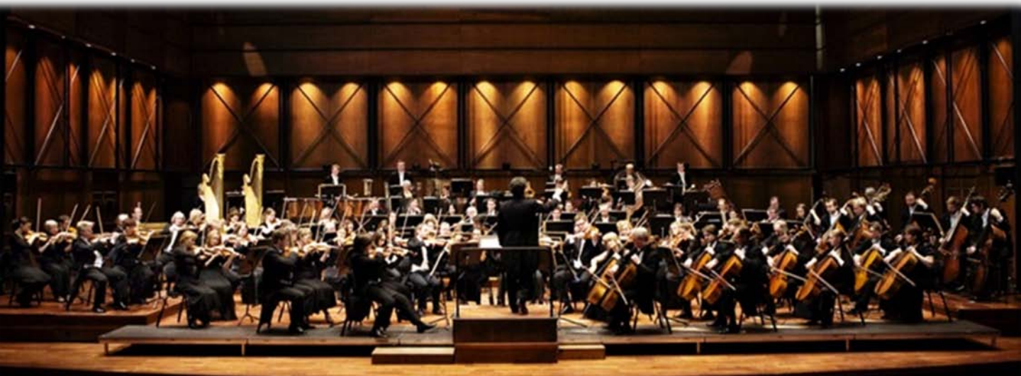
Most Thursdays, we enjoy a concert from Trondheim Symfoniorkester