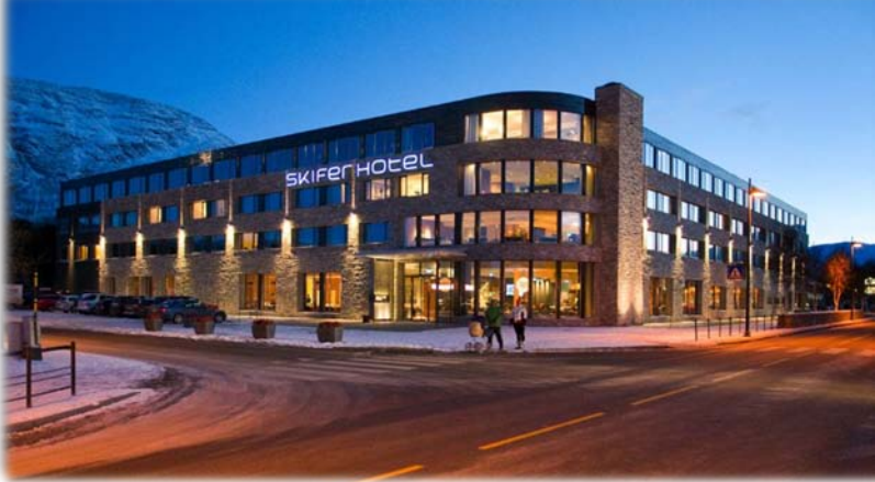
January: NTNU's annual leader meeting at Oppdal