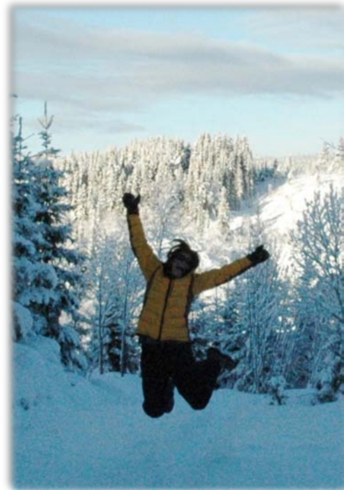
We never get enough of the snow and long winters ☺