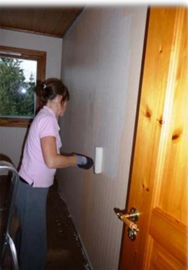
A major upgrade of one of our guestrooms