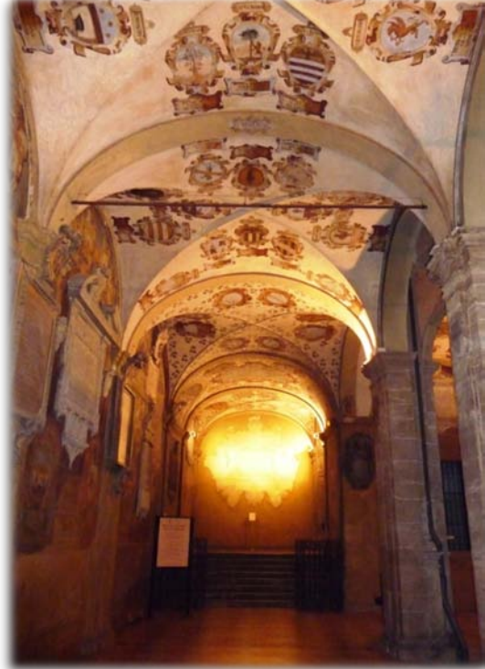
Bologna is famous for its archways