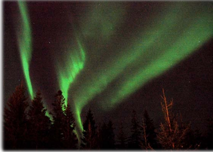
Beautiful Northern Lights from our own window