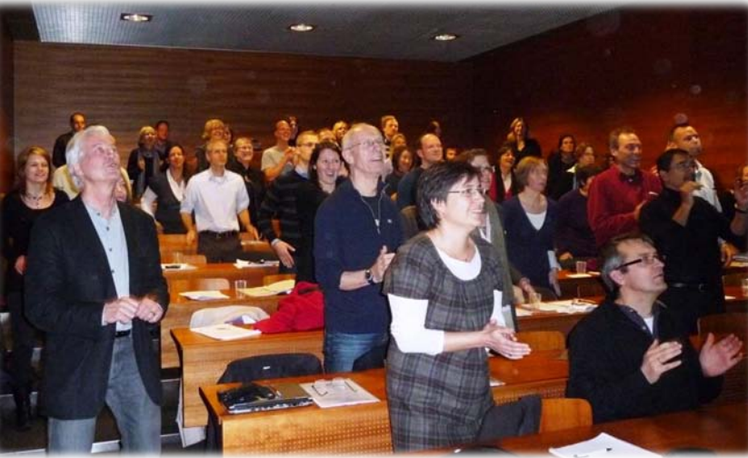
Rhythm & Blues at Mobex 2012 in Zürich