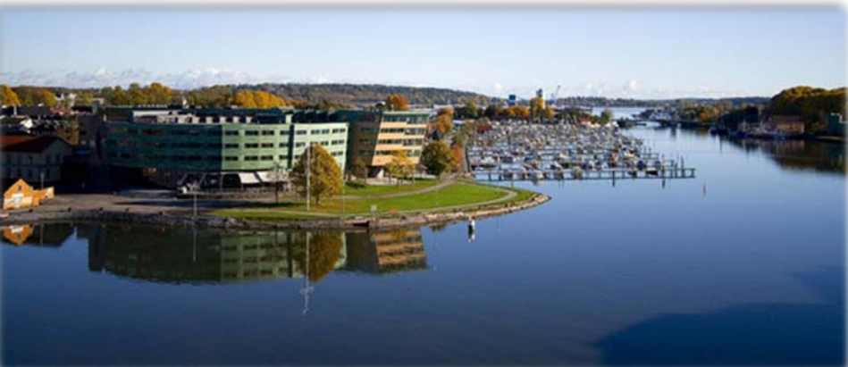
November: the annual HR conference at Tønsberg