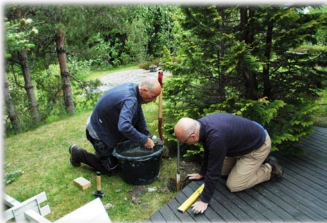
Replacing the birdhouse