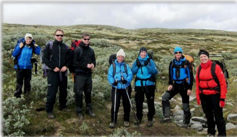
September: a «team building and hiking trip» at Dovrefjell with the HR-department of DMF