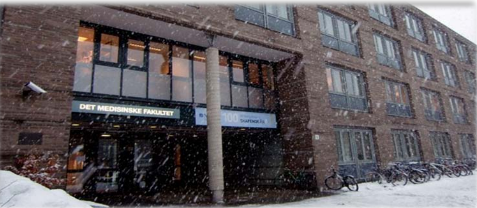
The building where Albert's office is