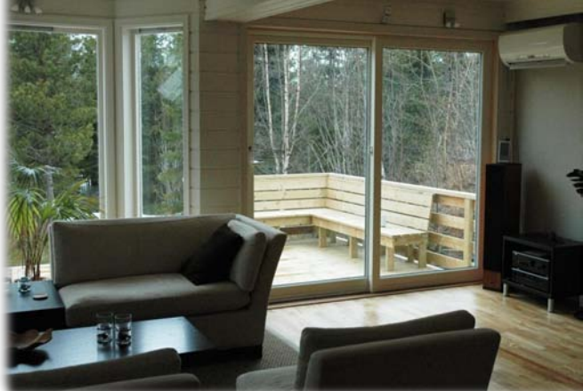
New sliding doors to the terrace