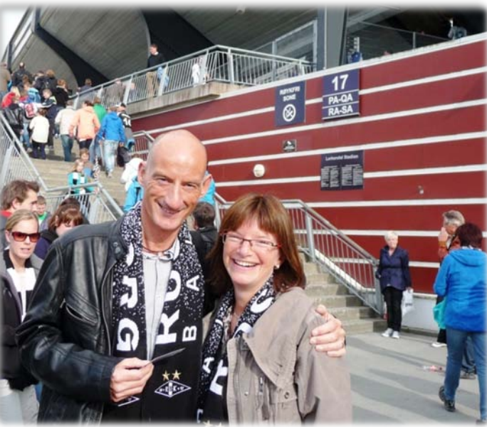
Treated to a RBK football game in May

Still ☺ But then, we have very good reason to! Here are some of the pleasures in our life.