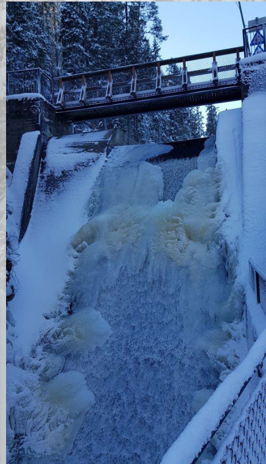
Even waterfalls freeze over in this country