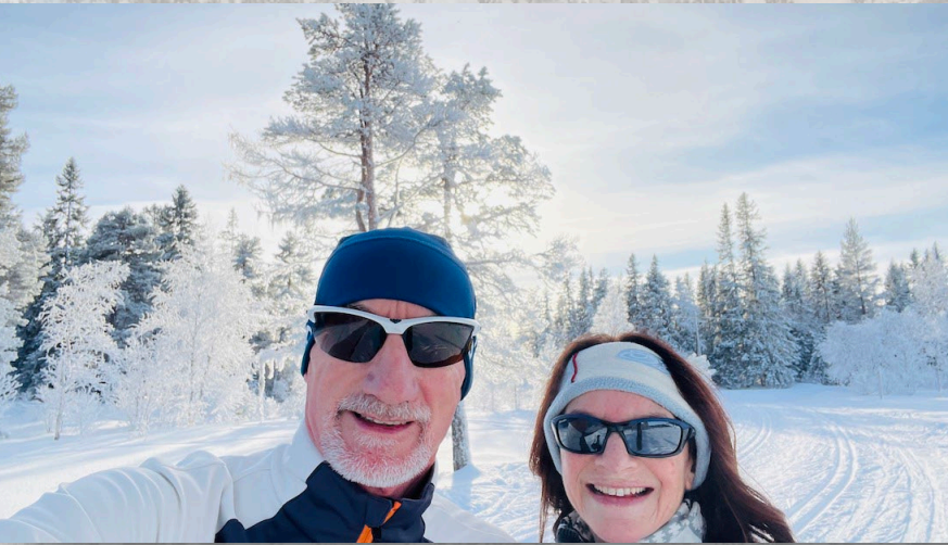
Enjoying cross-country skiing in winter wonderland