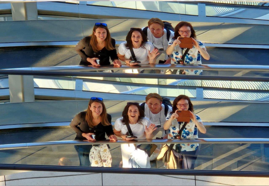
Enjoying a free afternoon with some of her team in Berlin