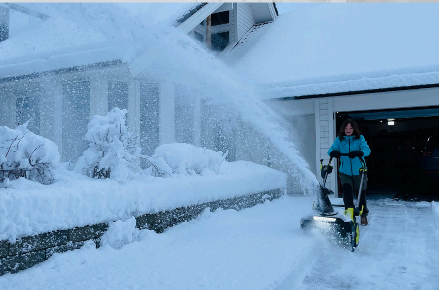
After 15 years of shovelling snow by hand, we finally invested in a snow blower – life made easy 😊