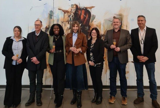
Acting Dean for a PhD defense