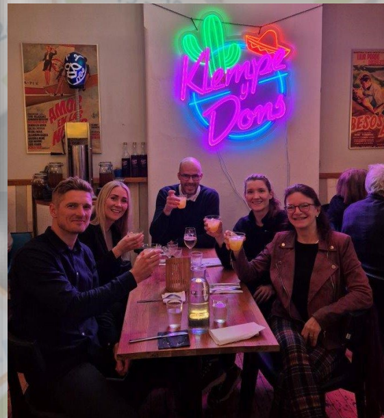
The NeXt Move team celebrating another year over