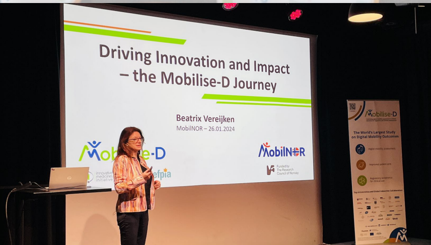
Last Patient, Last Visit in the Mobilise-D Clinical Validation Study