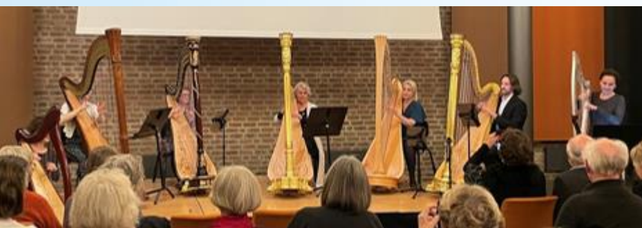
Unique - 7 harps on stage