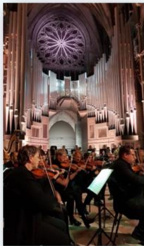
Light concert in the Nidaros cathedral