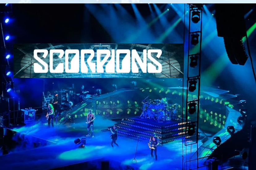
Still rocking – the Scorpions