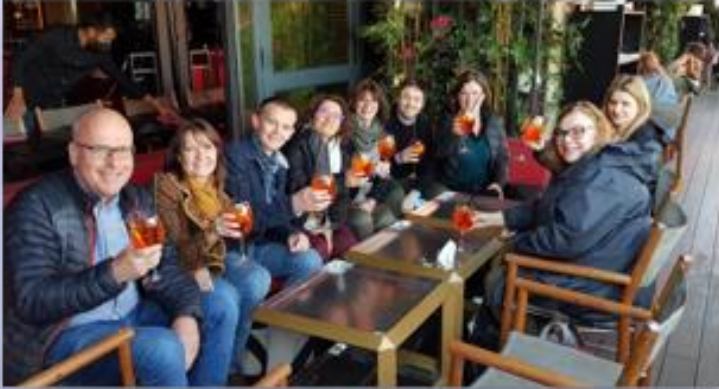
Mobilise-D leader team in Barcelona – in 3D