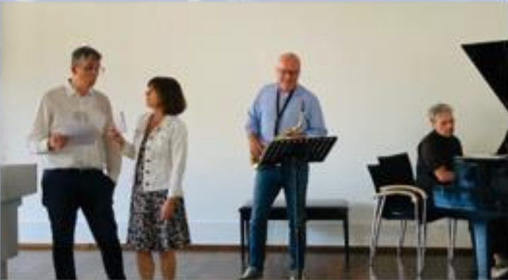
Mini jazz concert at MobEx - Heidelberg