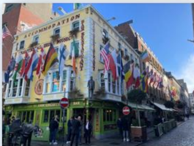
Temple Bar district – Dublin