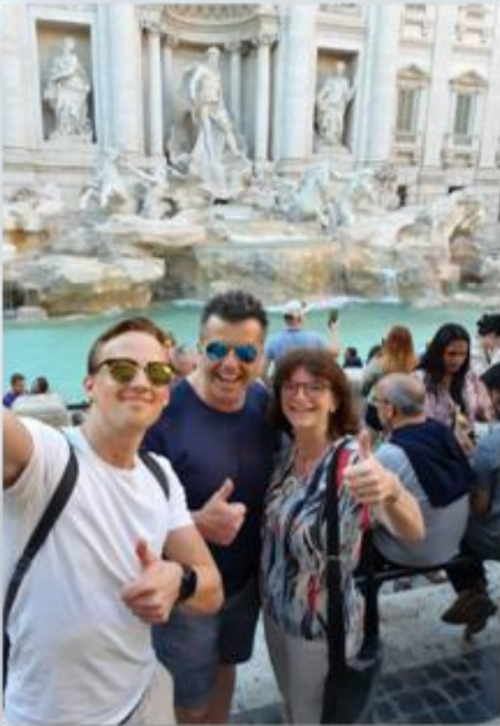
Rome, sweet Rome