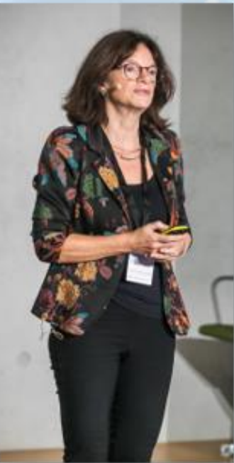
Invited presentation in Luxembourg